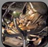
Large transmission adapter. Practical fixing points.