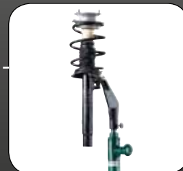
McPherson strut support. Capacity 100 kg.