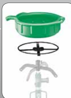
Fluid drain. Oil drain pan 18,9 litre. Ideal for fast and easy oil changes.