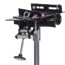
Adjustable transmission tool tilts to enable positioning and safe handling of transmissions.