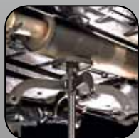
Ideal for handling and supporting exhaust systems, fuel tanks, etc.