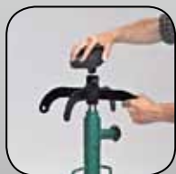
Reversible transmission adaptor with saddle and rubber pad.

Ideal for many undercar jobs. Much more than just a tool for removal and fitting of transmissions.