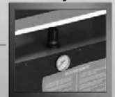
Inbuilt Pneumatic Lines