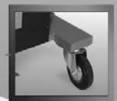
Heavy Duty 125mm swivel castors

The ultimate efficiency tool for your workshops! These trolleys allow your Technicians to have everything they need for a service right at their finger tips.