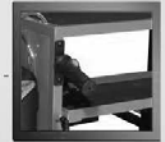
3 Instrument and Parts Placement Trays