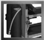
Pneumatic Tube Holder