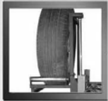
Support Bracket for tyre when lifting