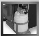
Waste brake fluid containment