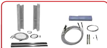
Optional Height and Width Extension Kits. Overall height can be adjusted from 3821mm to 4431mm. Overall width can be adjusted from 2850 to 3000mm.