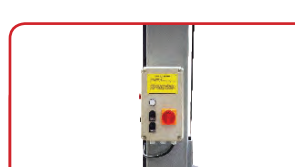
24V voltage control device, more safety and convenient.