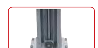
Hydraulic Direct-driven cylinder