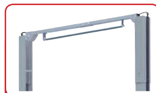
Overhead safety cut off device preventing vehicle damage