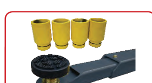
Both insert and screw rubber pads with 3" extension adapters.