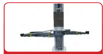
Super Asymmetric Arms allow to load different vehicles in an asymmetric or symmetric configuration