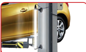
Optional 24V LED light Kit No. LT0006